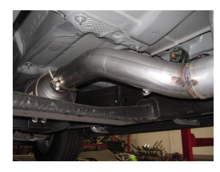
2.Install head pipe #A onto your factory pipe using your stock clamp insert welded hanger into the rubber grommet leave clamp loose.

1. Disconnect the negative battery cable before removal of the OEM Exhaust. This will allow the computer to reset and recognize the new exhaust. Lay out the exhaust on the floor so it looks like the drawing and compare parts with manual. Remove the factory exhaust by cutting behind the factory muffler. Once the tail pipe has been removed un-bolt the muffler and head pipe at the clamp located in front of the factory muffler . Use wd-40 or another type of penetrating oil to remove the rubber grommets. Do not damage these they will be re used. Removing spare tire is recommended for an easier install .