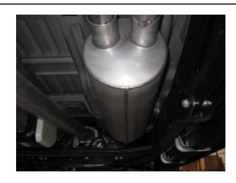
3. Install muffler #B onto head pipe 1.5" to 2" muffler should be level use clamp #E to secure together do not tighten.